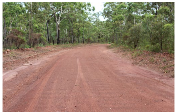
Elcho Island: (top) Mission Beach, (centre) basketball court at Galiwin'ku school, (bottom) road near Galiwin'ku.