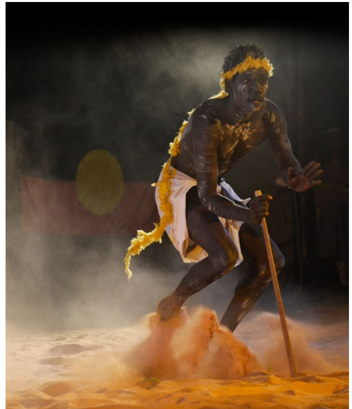
Djuki Mala performing at DanceSite 2013 in Borroloola, NT.

In 2013, the Chooky Dancers changed their name to Djuki Mala . Djuki is the adopted word for 'chook'. There is no 'ch' in Yolngu language – the closest approximation is the 'dj' sound, and many words end with a vowel sound. This vowel ending is commonly added to English words that are adopted for introduced animals or concepts – hence chooky/djuki from 'chook', an introduced domestic bird. Mala means a group or set of people who share a common feature. The change of name has therefore not affected the meaning of the group's name, however it does reflect that the members of the group do not speak English as their first language.